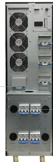
E91-15/20kVA rear view