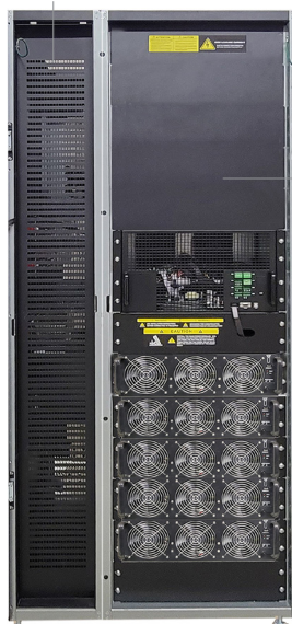
X90-5S 350kW UPS (door removed)

UPS Enclosure Includes slots for up to (5) 70kW power modules