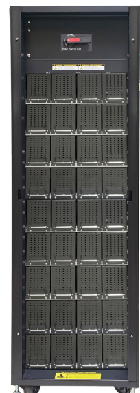
X90-BC (door removed)

UPS Enclosure Includes slots for up to (5) 70kW power modules