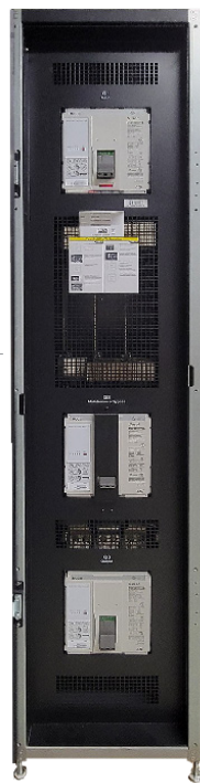
Maintenance bypass (door removed)