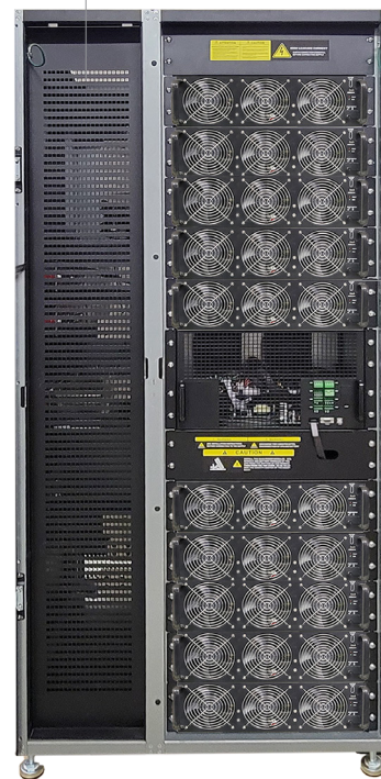
X90-10S 700kW UPS (door removed)

UPS Enclosure Includes slots for up to (10) 70kW or 50kW power modules