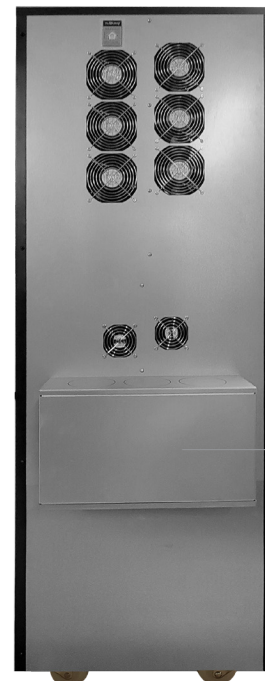
E91-40K rear view

Top or bottom cable entry from rear. Terminations in the front