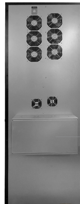
E91-40K rear view