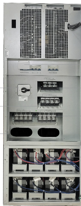
E91-40K front view (door & panels removed)